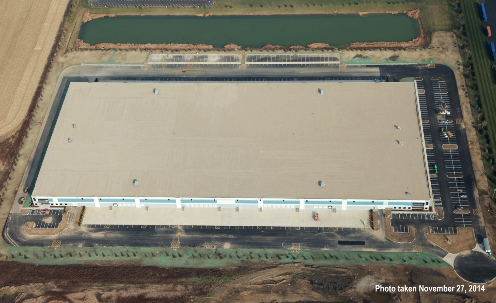
Photo taken November 27, 2014